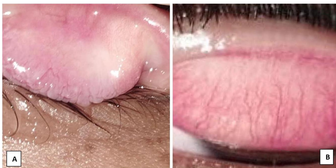
Fig. 1: Efficacy of supratarsal triamcinolone injection after 2 weeks on the upper tarsal conjunctiva. A shows inflammation of the upper tarsal conjunctiva and presence of giant papillae (largest measuring ~6mm). B shows significant resolution after treatment at two weeks follow up (largest measuring ~3mm).